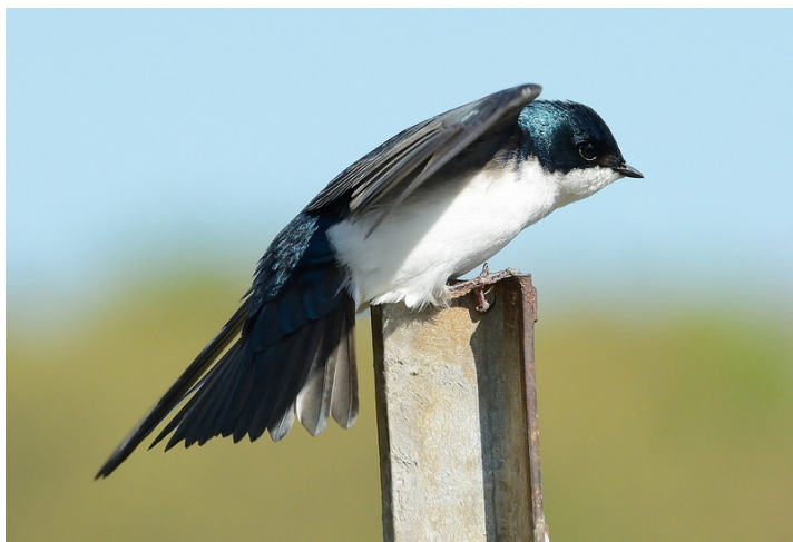
Tree Swallow at Patuxent Research Refuge, MD